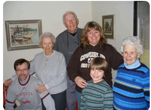
Main Trip March 2008