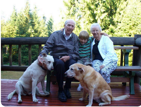
Granite Falls WA June 2006