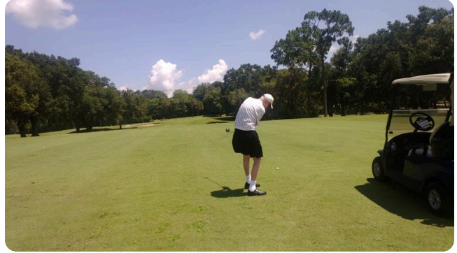
June 2013 Mt. Dora Golfing